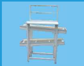
On Line FIFO