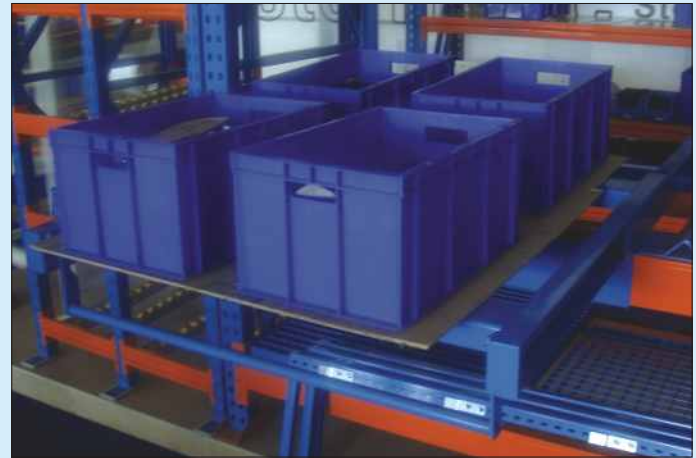
Pull-out shelf on open position