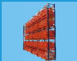
High Rise Storage