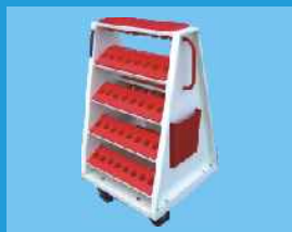
CNC 'A' Type Trolley