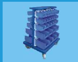
FPO Bin Trolley