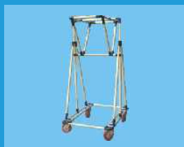
Pipe & Joint