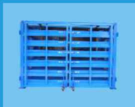
Sheet Storage Rack