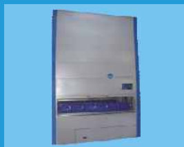
Auto Store Lift