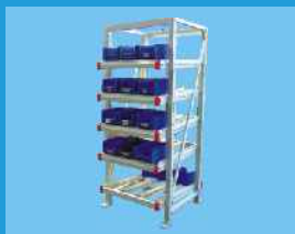
FIFO Storage Rack