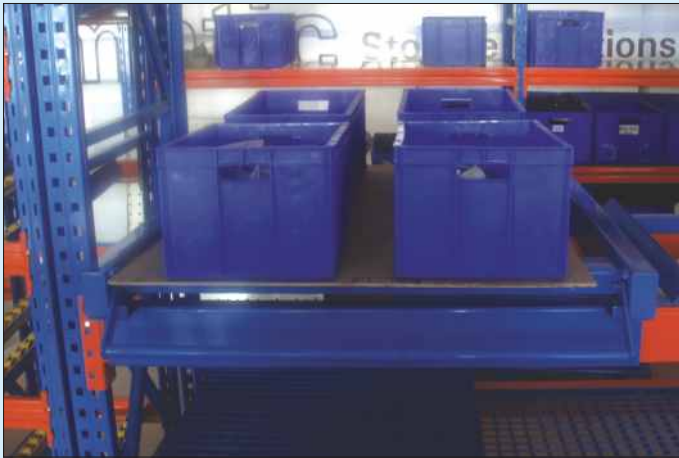
Pull-out shelf on close position